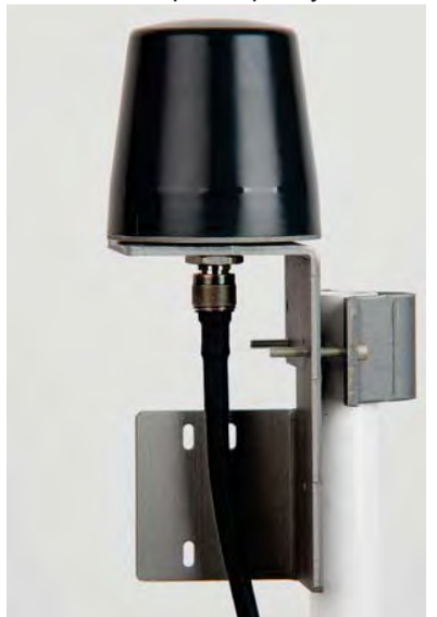
Model 8230AJ (with ANT-KT mount)

The GPS/GNSS antenna must be installed outdoors with an unobstructed view of the sky (to 20° elevation from the horizon). An unobstructed line of sight to the sky allows the antenna to locate and track the maximum number of satellites throughout the day. Installations with obstructed views may still prove functional, but the equipment may experience reduced reception quality or be unable to simultaneously track the maximum number of satellites. Make sure the antenna